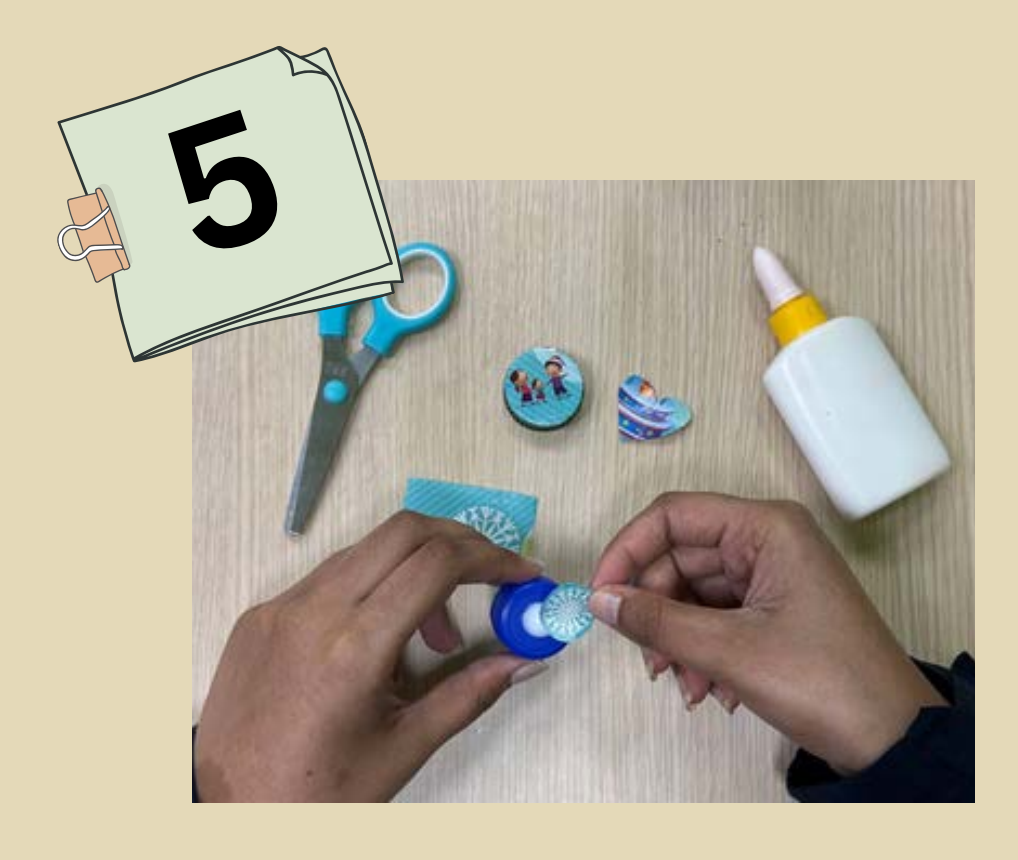
Using your wrapping paper, cut out fun shapes to stick onto the bottle caps.

Using your glue, stick on the glitter onto your bottle caps to make some colourful snowmen.